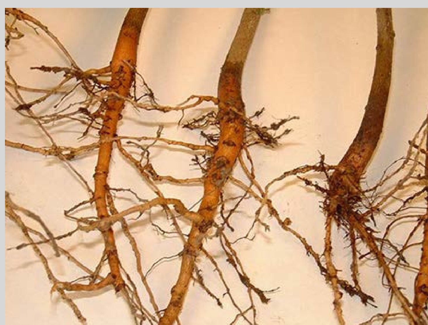
Figure 2. Root-knot nematode damage on cotton roots.