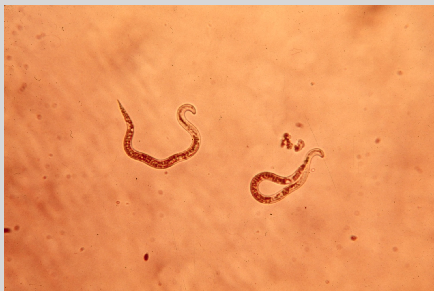
Figure 1. Second stage juveniles of the southern root-knot nematode.

Plant parasitic nematodes are an economically important pest of cotton throughout most of the cotton growing areas of the United States (Fig. 1). On the Texas High Plains, the southern root-knot nematode, Meloidogyne incognita , is the predominate nematode species of the population infesting cotton (Fig. 2). In irrigated cotton where nematode populations are historically high (usually areas where sandier soils are most prevalent) many growers opt to utilize a partial nematode tolerant cotton variety since the loss of Temik. The use of foliar applied Vydate has provided protection from nematodes when it was used alone or in combination with Temik. Partial nematode tolerant cottons have yield loss when not protected chemically by nematicides as demonstrated when Temik was available. The need for additional control has encouraged the use of Vydate CLV following plant stand establishment.