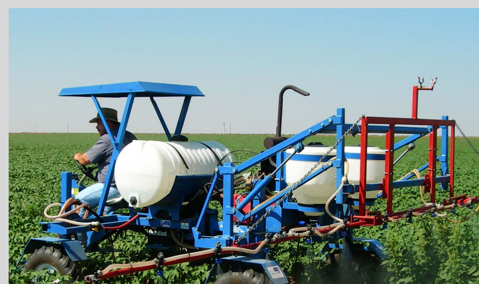
Figure 3. Self propelled sprayer.

Field trials were conducted in Hockley County, near Levelland, Sundown and Ropesville, Texas. Based on fall soil sampling each year, a minimum of 7,000 eggs and 1,500 root-knot juveniles were present per 500 cm 3 of soil from study fields. Cotton containing Flex or Glytol and Bollgard II or Widestrike technology in 'FiberMax 9170', 'DeltaPine 1032', or 'Phytogen 367, 375, or 499' was planted on 12 May 2011 near Sundown; 'FiberMax 2011, 2484', 'DeltaPine 1219', 'Phytogen 367', 'Stoneville 4288, or 5458' was planted on 17 May 2012 near Ropesville; and 'FiberMax 9160', 'Stoneville 5458', 'DeltaPine 1044', 'Phytogen 367, 375, or 499' was planted on 22 May 2012 near Levelland on 40-inch rows and irrigated using a pivot or drip irrigation system. Plots were a minimum of 6-rows wide x 50-feet long. Plots were arranged in a randomized complete block design with 3 replications. Foliar applications of Vydate CLV were applied with a self-propelled sprayer (Fig. 3) calibrated to deliver 17 gallons per acre. Vydate CLV applications were made on 8 and 15 June 2011 at Sundown, 12, 19 and 26 June 2012 at Levelland, and 7, 14 and 21 June 2012 at Ropesville. A detailed list of treatments are outlined in Table 1.